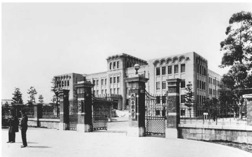
Looking at the Humanities building from the front gate (1924)

Website: http://www2.lit.kyushu-u.ac.jp/en/