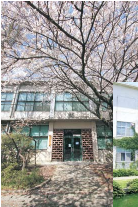
Below: The Humanities Dept buildings located at Hakozaki

March 1, 2011—March 31, 2011 (Must be received no later than March 31, 2011)